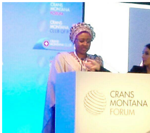
Mrs.Aisha Buhari during the session on “Extremism and Radicalization”

The Crans Montana Forum is a Swiss Non-Governmental International Organization whose importance and prestige have been globally well-established since 1986. It is formally recognized by and works with all major International Organizations, respected Governments, Business and Non-Governmental Organizations.