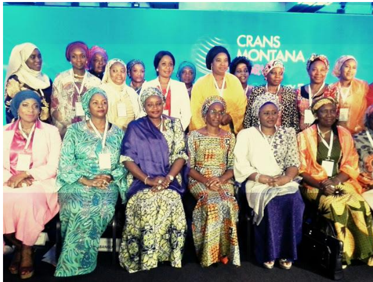
Mrs.Aisha Buhari, Mrs.Dolapo Osinbajo and other dignitaries

She stated that it is important for women to play a key role in educating a child and that if a woman can get it right the rest of the work is done. Mrs. Buhari also stated expressly that the topic of discussion is what attracted her to the forum considering the security issues Nigeria is currently facing.